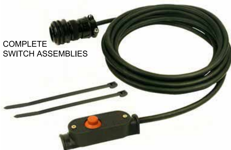
COMPLETE SWITCH ASSEMBLIES