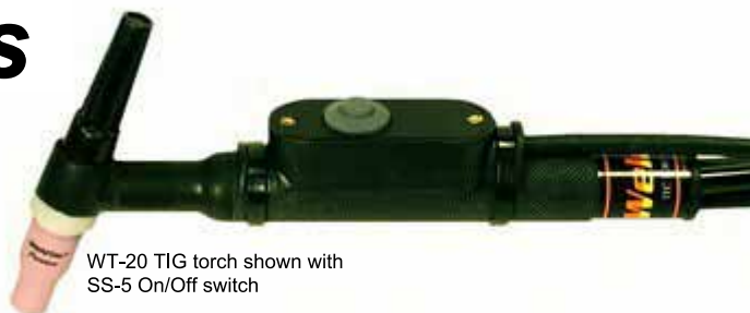
WT-20 TIG torch shown with SS-5 On/Off switch

These new “SS” switches are the latest advancement in torch mounted controls. They mount quickly and easily to most torch handles with convenient tie straps. They come complete with switch, cord, and machine plug.