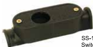
SS-100 Switch Saddle