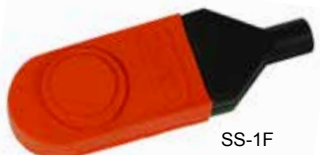
SS-1F Snap Action Switch Board