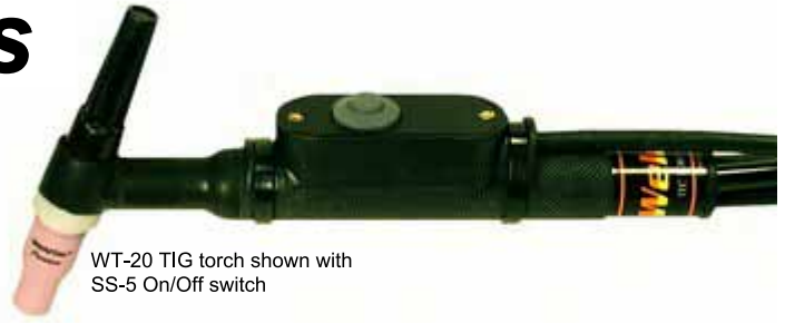
WT-20 TIG torch shown with SS-5 On/Off switch

These new "SS" switches are the latest advancement in torch mounted controls. They mount quickly and easily to most torch handles with convenient tie straps. They come complete with switch, cord, and machine plug.