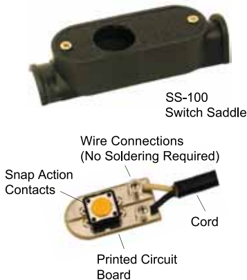
SS-100 Switch Saddle

Wire Connections (No Soldering Required)