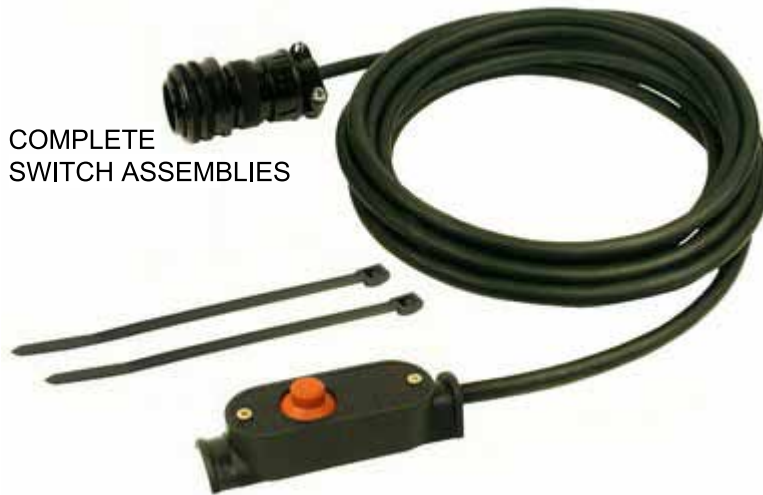
COMPLETE SWITCH ASSEMBLIES