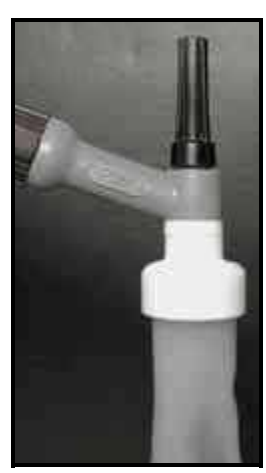
Actual Smoke Flow Photo