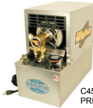
C45 PREMIUM - DUAL COOL (4 Gallon)

MODEL C25 STANDARD C35 DELUXE C45 PREMIUM - DUAL COOL™