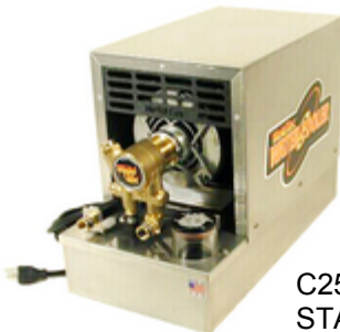
C25 STANDARD (2 Gallon)

TEC WELDING PRODUCTS, INC. P.O. Box 1870 • San Marcos, CA 92079 • Phone 760-747-3700 www.tectorch.com www.weldtec.com