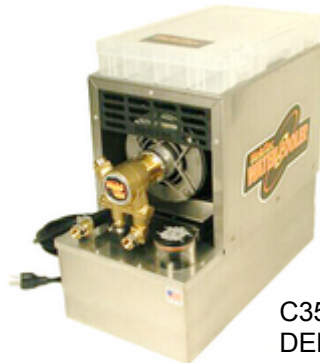
C35 DELUXE (3 Gallon)